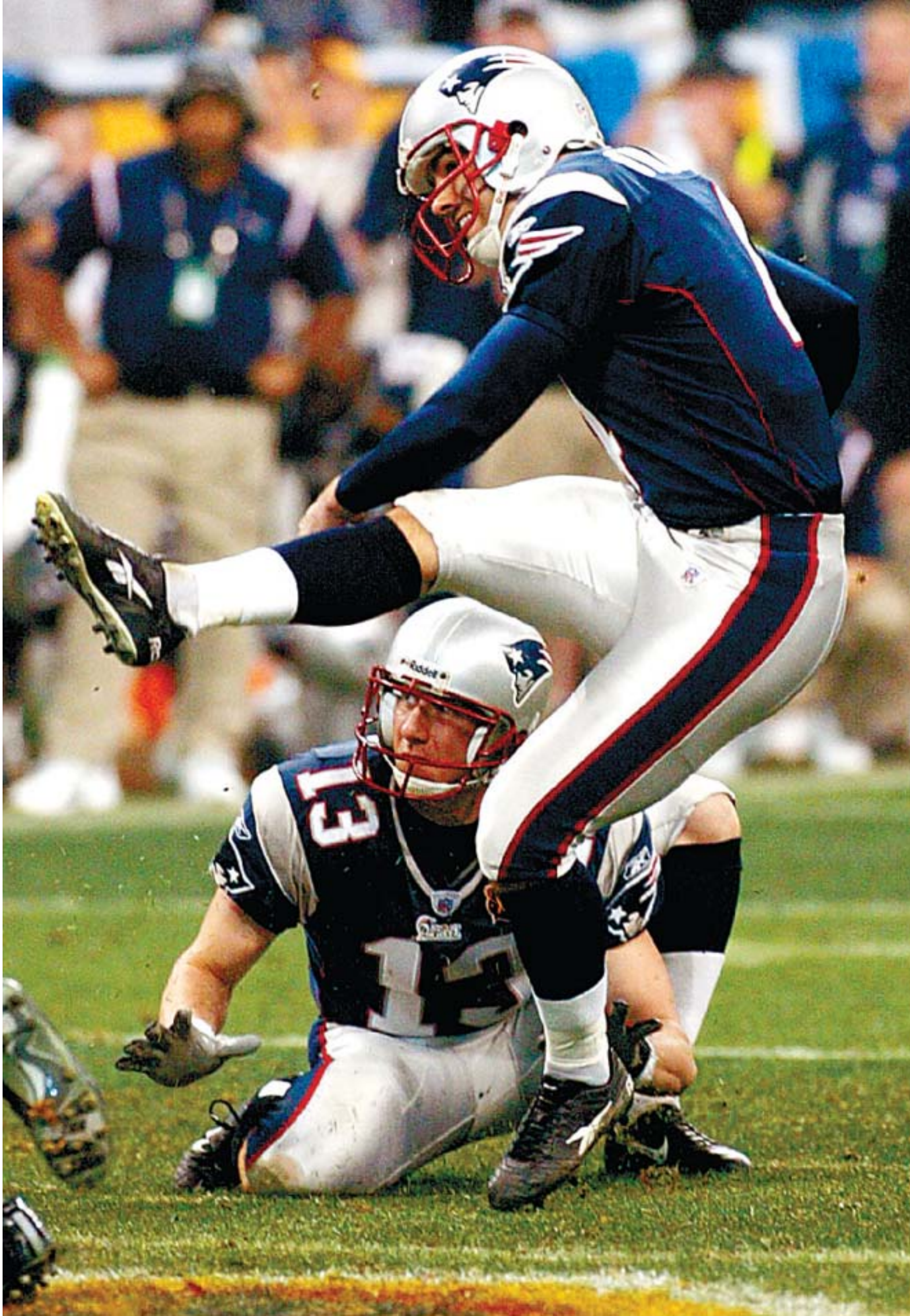
In another photo finish, Adam Vinatieri again provides the winning kick, a 41-yard field goal to give the Patriots their second Super Bowl victory.

It's a perfect ending to sequel as Vinatieri delivers another world title to Patriots